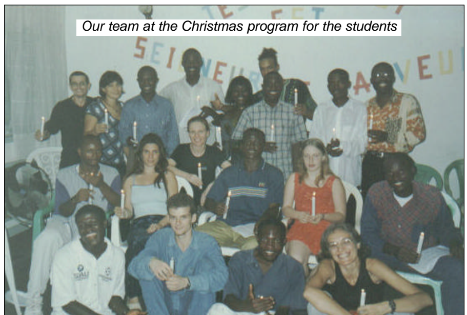
Our team at the Christmas program for the students