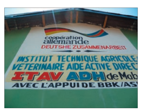
16. School sign ITAV ADH Mabala