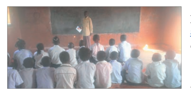
15. Mushapo School after the unrest there

For more details or our activities, you can see reports of the last 20 years here <a href="http://www.adh-congo.org/en/updates/annual-reports">http://www.adh-congo.org/en/updates/annual-reports</a>. Photo 23 shows the location of our projects.