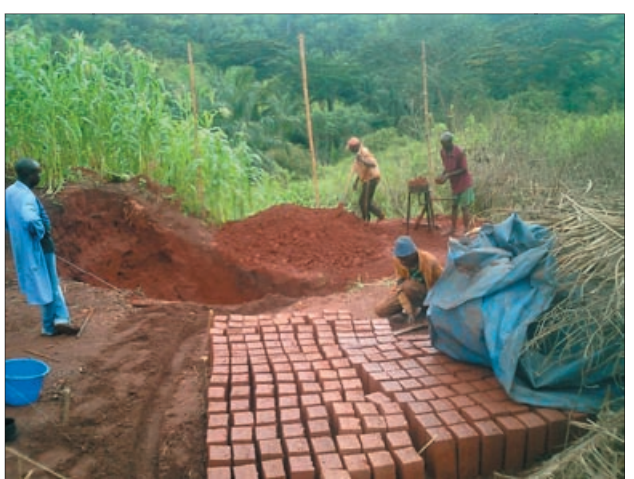
8. Bricks formed from local clay in Mushapo