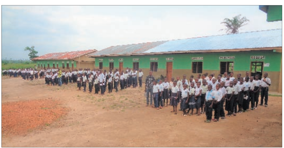
17. 276 students, 15 teachers, 6 classrooms, 40 ha land for agriculture