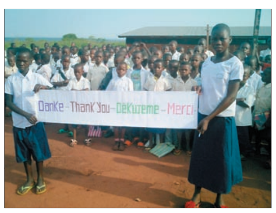
13. Children, thankful for free schooling