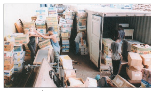
4. Our 2<sup>nd</sup> container: Douala in Cameroon

interior in Mushapo (photos 8-11). During this time, more than 2000 pupils (photo 12 & 13) received free education in our school, unheard of in Congo at that time.