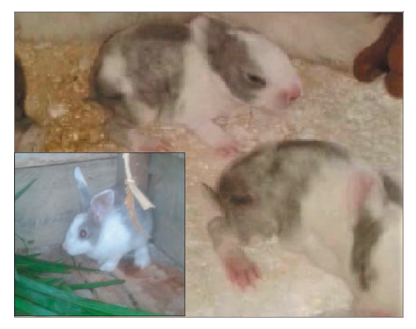
New rabbits for veterinary training

ADH is paying half the salaries for the 15 teachers and school director, while our partner organization BBK is supposed to pay the other half. Unfortunately, this has been a struggle and we are trying to find a solution. One way we hope to supplement the teachers' salaries is by encouraging them to do agriculture on our 40-hectare property around the school buildings.