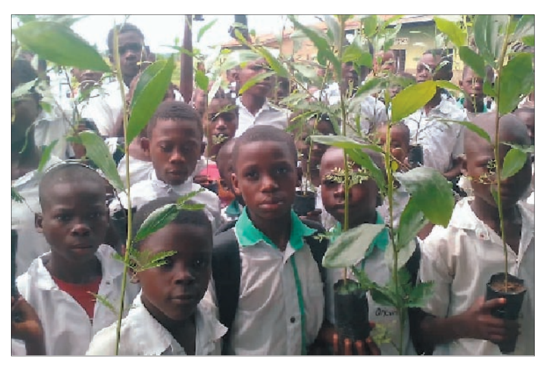
Students ready to plant acacia trees around our property

Email <u>w.schmidt@a-d-h.org</u> Website <u>www.adh-congo.org</u> Facebook <u>https://www.facebook.com/ADHCongo</u> Instagram <u>https://www.instagram.com/adh_congo/</u>