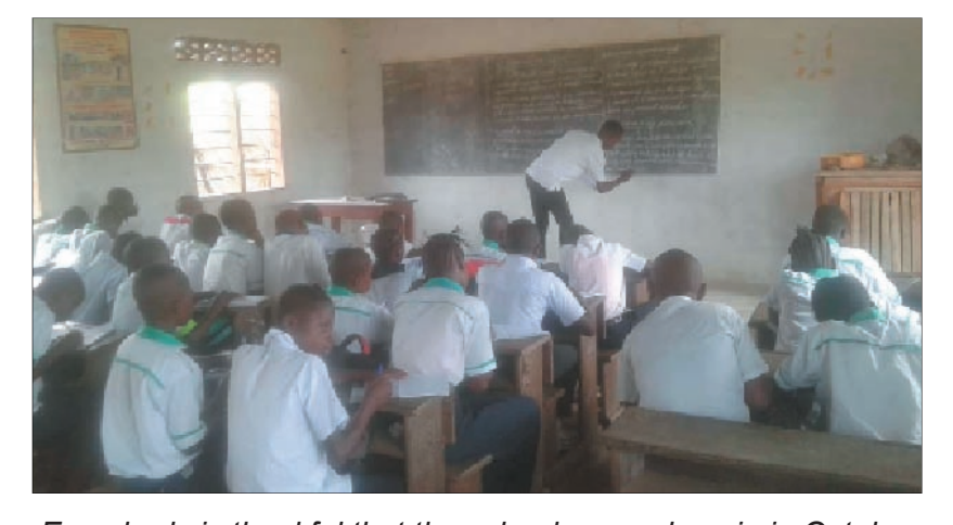
Everybody is thankful that the school opened again in October

Another obstacle with schools in Congo is the problem that in newly set up schools the teachers do not receive a salary from the government, especially with secondary schools in the countryside, like ours in Mabala. Instead, the students have to pay tuition. Since we want to offer free school lessons to children from poor