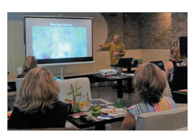
"Change the World with Love" speech