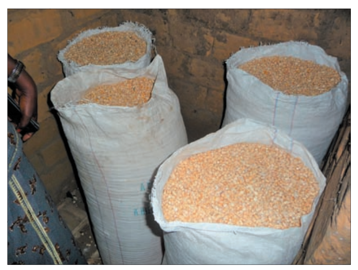
The maize is filled into bags of up to 120 kg each

encouraging maize plantations . You may remember that we brought 500 kg of maize to Mabala 2 years ago. It took a long time for this project to take root, but after we offered the farmers to buy the maize from them, they were encouraged to grow more. Now they even sell the maize to traders who ship it to Kinshasa and sell it there.