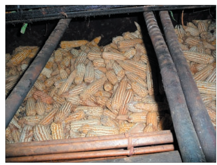
Drying the maize for longer preservation