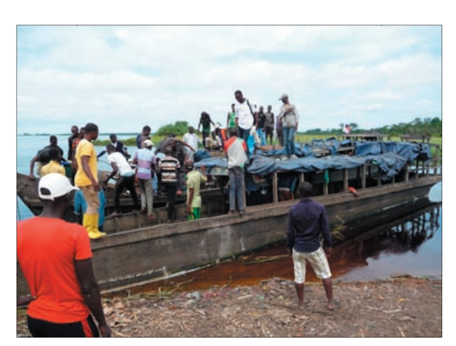
Locally fabricated boats for people & goods