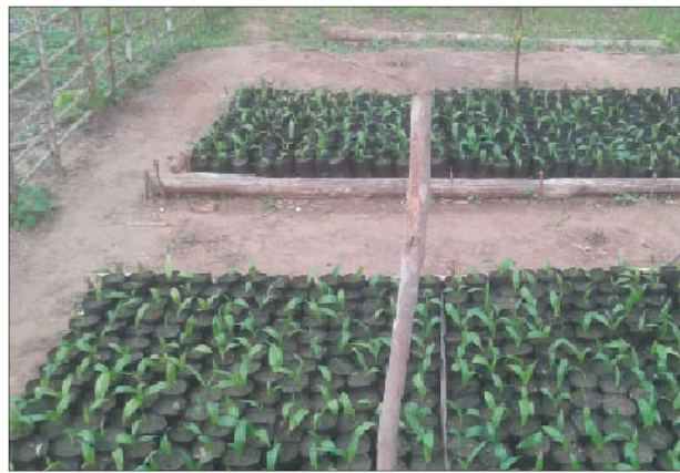
1,100 palm nut seedlings next to our school

families, we try to avoid that their parents have to pay school fees, which means, we have to find other ways to pay the teachers.