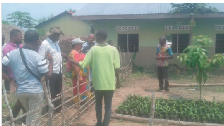
World Bank representatives came from Kinshasa to see the palm nut nursery and our chicken and rabbit project

We are supporting the efforts of the teachers to plant manioc and because the students receive free schooling, they are helping with this agricultural project. The land belongs to our school, and so we encourage the teachers and students to grow more and more food to support the school. This also gives the students hands-on-training while the raising of chickens and rabbits continues to help them to learn how to care for such animals.