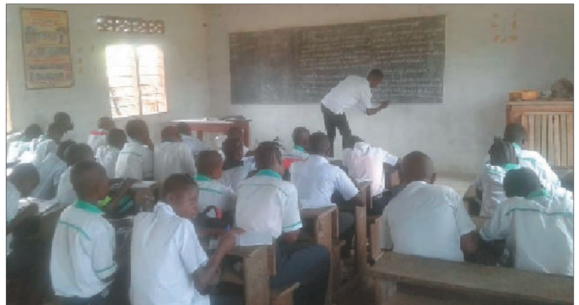
Everybody is thankful that the school opened again in October

Another obstacle with schools in Congo is the problem that in newly set up schools the teachers do not receive a salary from the government, especially with secondary schools in the countryside, like ours in Mabala. Instead, the students have to pay tuition. Since we want to offer free school lessons to children from poor