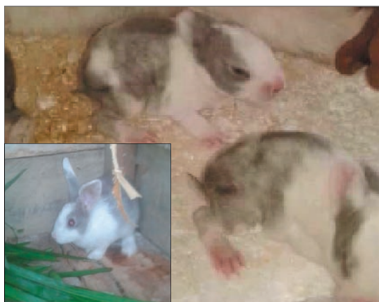
New rabbits for veterinary training

ADH is paying half the salaries for the 15 teachers and school director, while our partner organization BBK is supposed to pay the other half. Unfortunately, this has been a struggle and we are trying to find a solution. One way we hope to supplement the teachers' salaries is by encouraging them to do agriculture on our 40-hectare property around the school buildings.