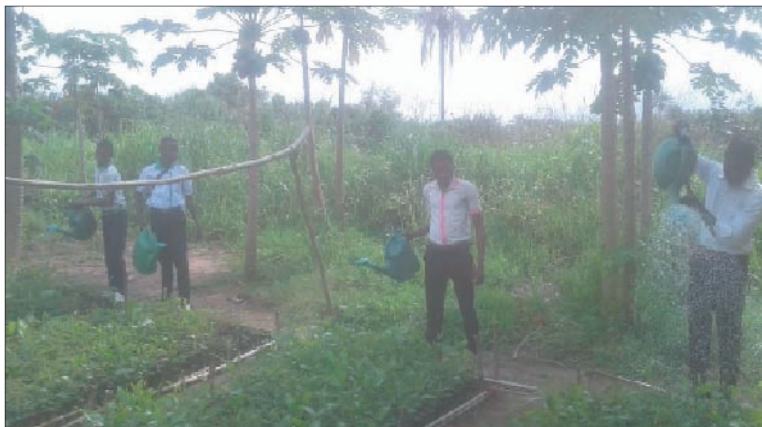
Students watering our acacia nursery - 1,000 seedlings