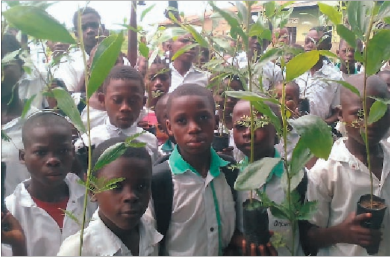
Students ready to plant acacia trees around our property

Instagram https://www.instagram.com/adh_congo/