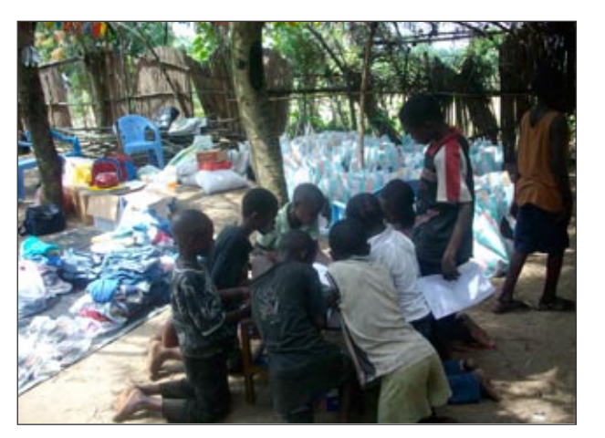
Orphans coloring, clothes & food packs in the back