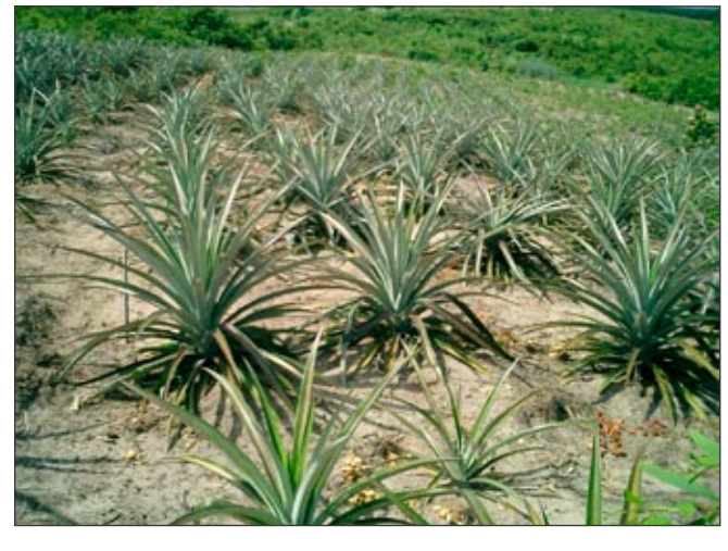
Pineapples are giving first income for the project