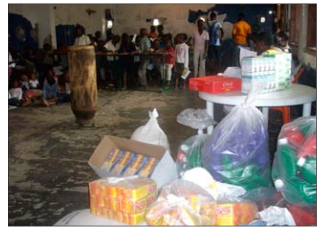
Food, medicine, clothes & toys for COLK orphanage