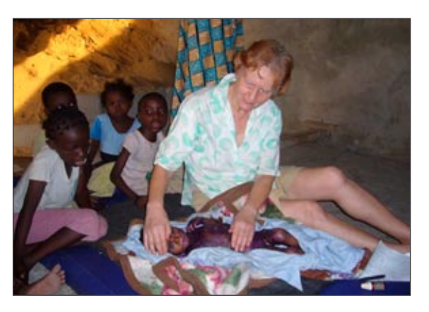
A very sick child just got "delivered" to COLK