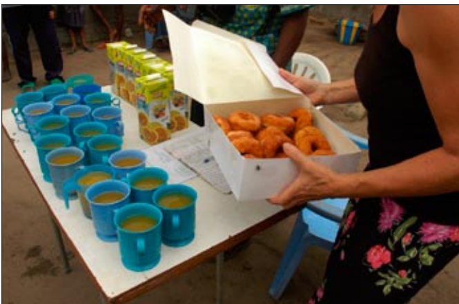
... especially with juice and fresh Christmas donuts!