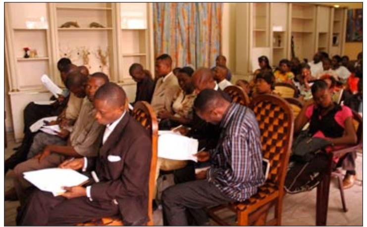
First two rows: graduates - behind: family and friends