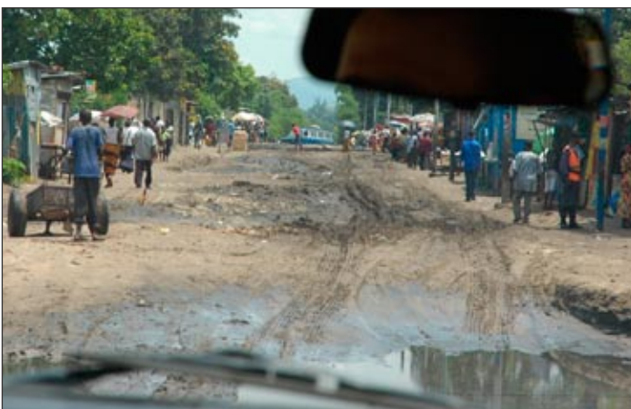
Without a good car we can't make it to the orphans