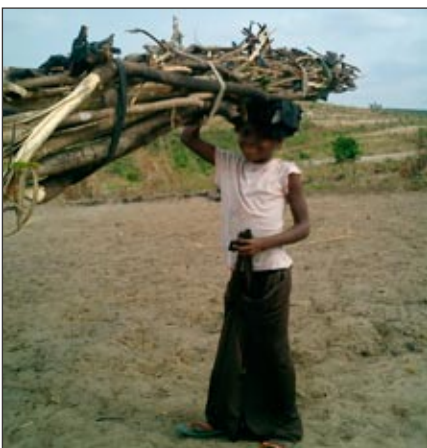
Orphan brings wood to the market