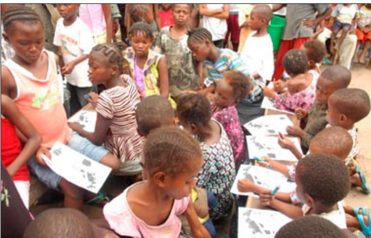
Orphans coloring in pictures, most of them for the first time