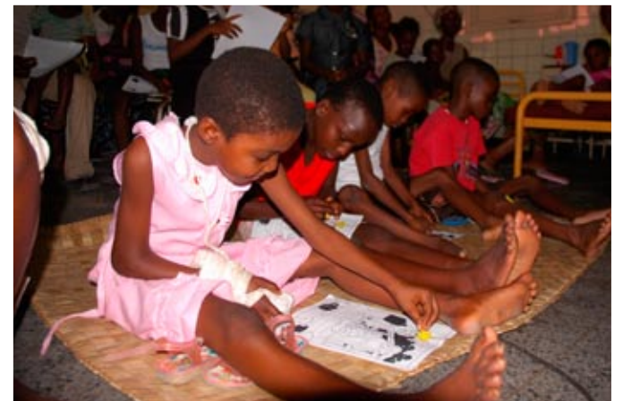
Children in the General hospital color in their pictures...

Another special “Thank You” goes to the Vodacom company which donated a very useful and needed Nissan pick-up. This is a big help as mobility and transport are so important in our