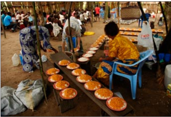
Hot off the griddle: it really tastes yummy...