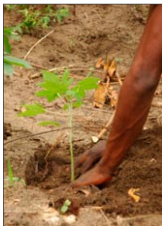
Papaya tree from our garden at the field. First pineapples after almost 2 years