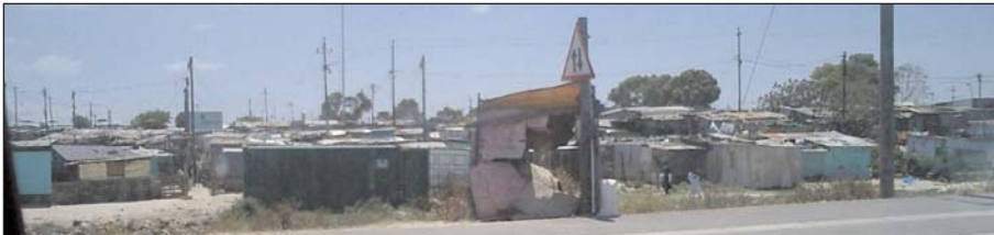
Different parts of the huge informal settlement Khayelitsha in Cape Town