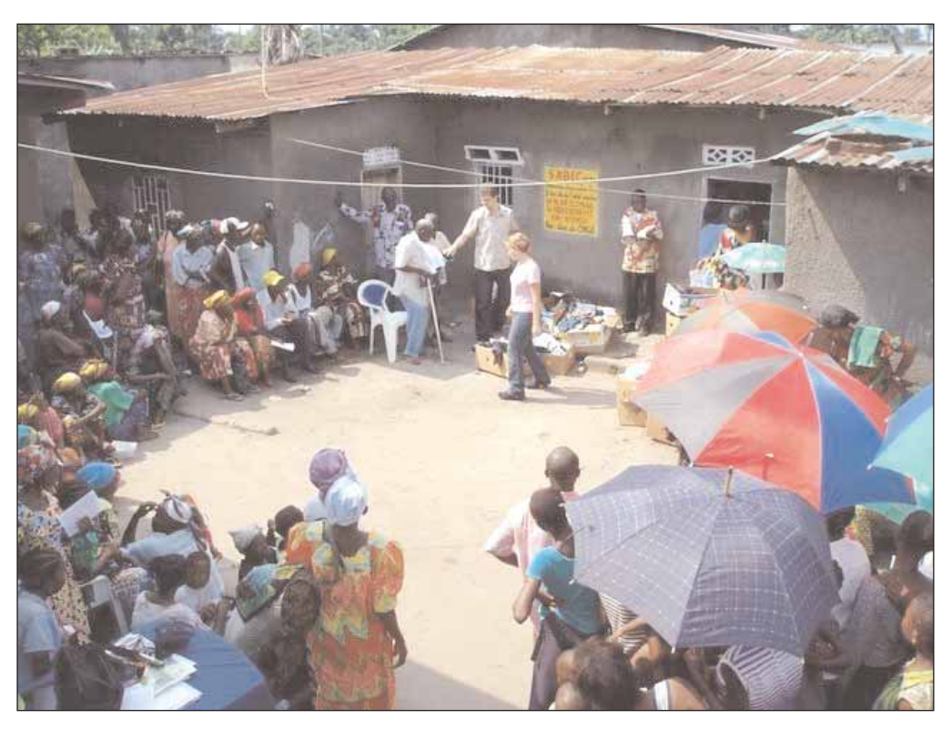
The poorest people from Kisenso were so thankful for our clothes, shoes, sheets etc.

As sweet as these people are, as difficult is their country! One of our close Embassy friends told us recently, how the security situation in the country was never as weak as it is now, since