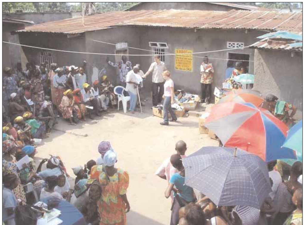
The poorest people from Kinsenso were so thankful for our clothes, shoes, sheets etc.

As sweet as these people are, as difficult is their country! One of our close Embassy friends told us recently, how the security situation in the country was never as weak as it is now, since