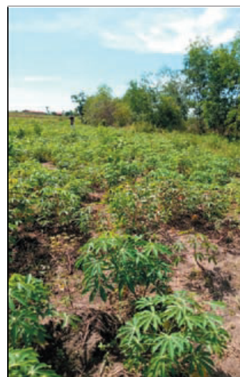
Girls carrying cassava seeds. Work on the field. 2 hectares cassava behind the school