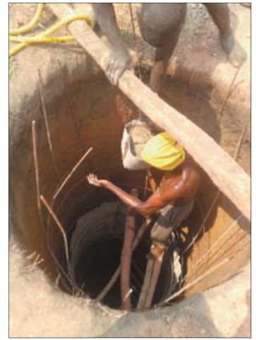
1. Digging well hole. 2. Preparing round cement walls. 3. Water filter. 4. Placing cement walls into the well.