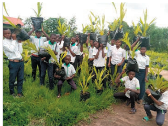
Pupils bring palm nut trees from our school to the plantation on our property.

After many similar previous ventures in Mushapo, all of which we unfortunately had to stop due to theft, this is a long-awaited dream that is gradually coming true for us. It will