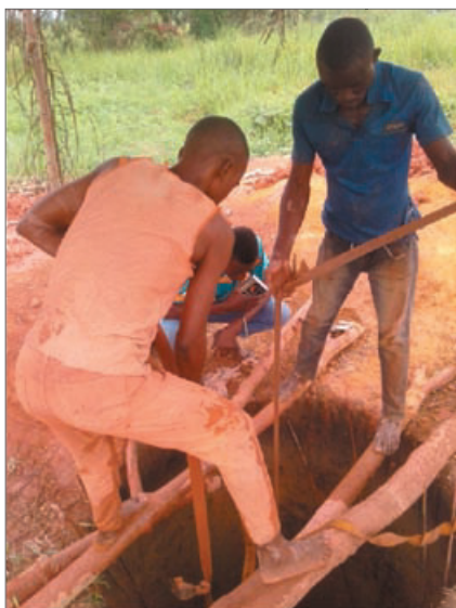
Work on the well in progress.